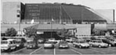
The Holiday Inn Holidome, host hotel of the Rochester Hamfest.