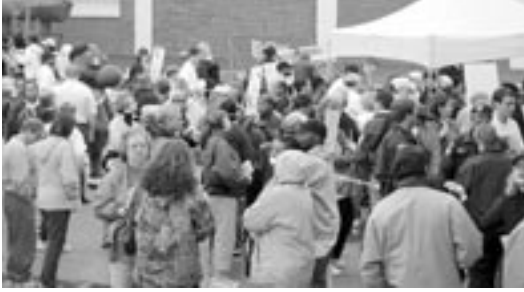
May 1st March of Dimes Walk-America was cool, but dry.