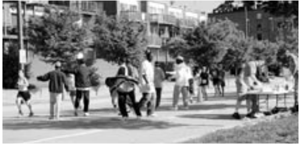
Water Station on the Veteran's Run, May 25th.