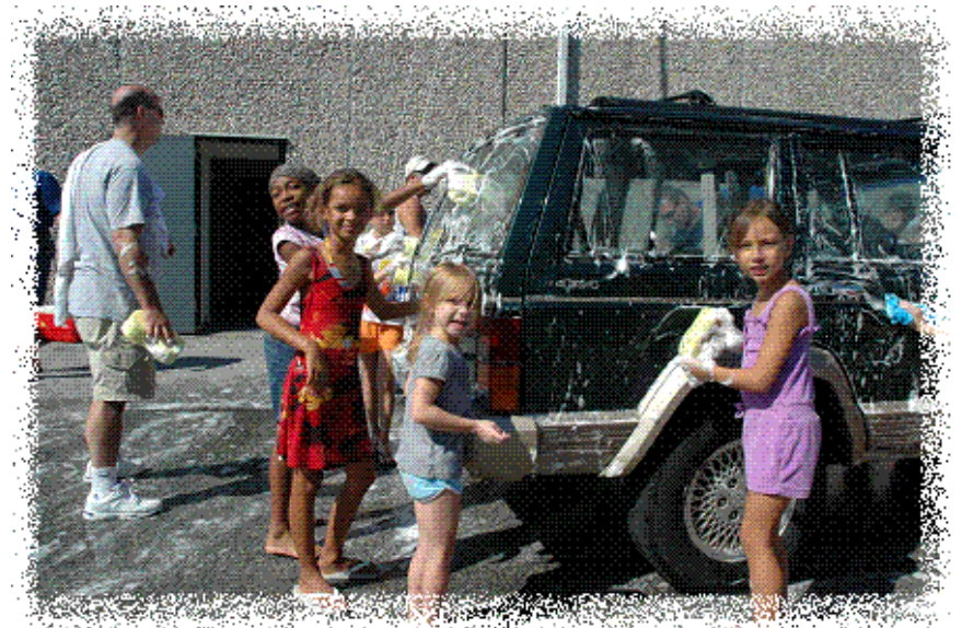
The Reisterstown Mustang Cheerleaders car wash raises money for their rec program

Our members have provided specialized communication modes for numerous situations.